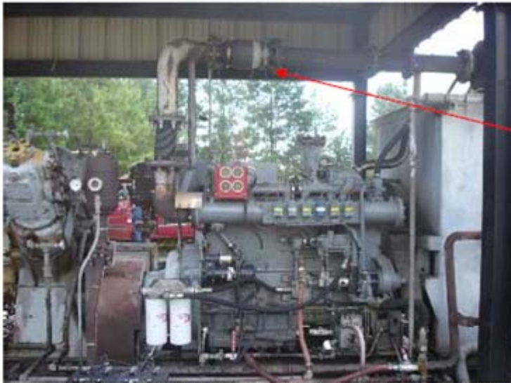
Figure 1. BP Findley Compressor Station with Catalyst Installation.