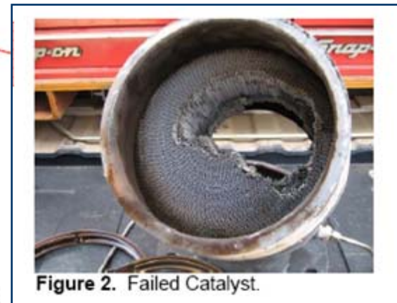
Figure 2. Failed Catalyst.